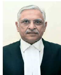
Court was recommended. The Centre withheld approval for

Jawant Singh name was proposed as the Chief Justice of the Orissa High Court in September 2022 as replacement for Justice Muralidhar, whose transfer as the Chief Justice of the Madras High